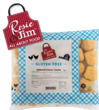
Rosie & Jim Battered Chicken Chunks 301371 | 6 x 1kg Only £49.85