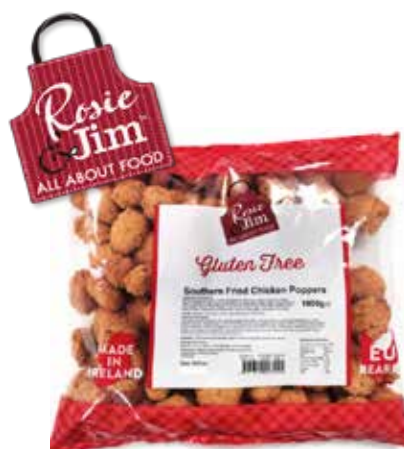
Rosie & Jim Southern Fried Chicken Poppers 301441 | 6 x 1kg Only £48.99