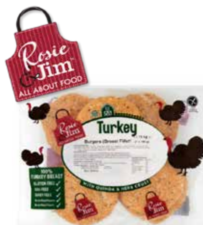
Rosie & Jim Turkey Burgers Frozen 300151 | 6 x 1.02kg Only £59.99