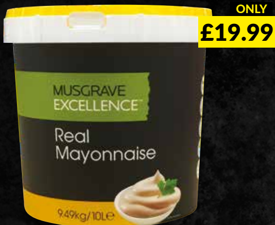
Musgrave Excellence Real Mayonnaise 485552 | 1x10 ltr

SAVE 15% OR MORE VS BRAND LEADER ON MUSGRAVE EXCELLENCE