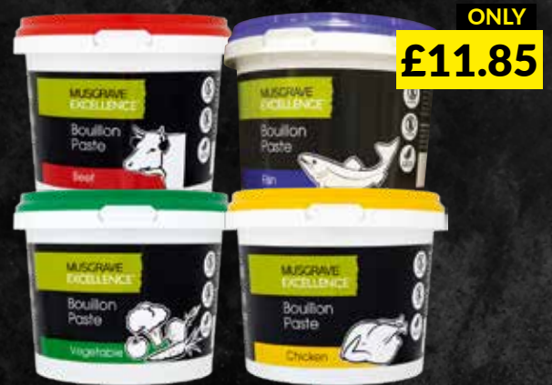
Musgrave Excellence Bouillon Paste | 1x880 g 698346 | Beef 698348 | Vegetable 698350 | Fish 698352 | Chicken