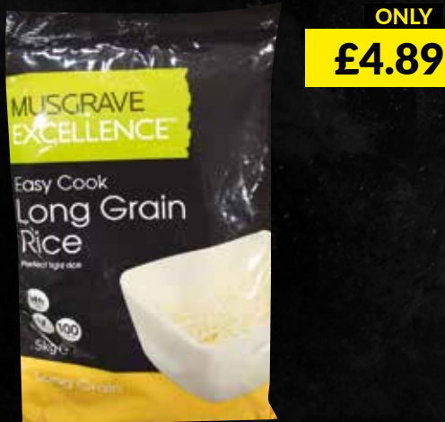
Musgrave Excellence Long Grain Easy Cook Rice 485769 | 1x5 Kg