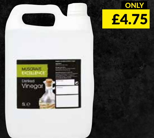
Musgrave Excellence Distilled Vinegar 546814 | 1x5 ltr

SAVE AT LEAST 15% VS BRAND LEADER ON MUSGRAVE OWN BRANDS