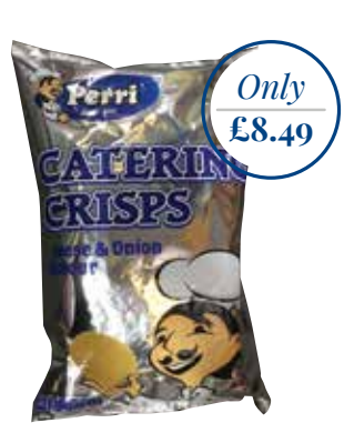
Perri Catering Crisps 172146 | 9 x 200g £0.94 per unit incl. VAT