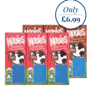
Mooies Milk | 27 x 200 ml Chocolate | 663308 Strawberry | 663307 £0.26 per unit