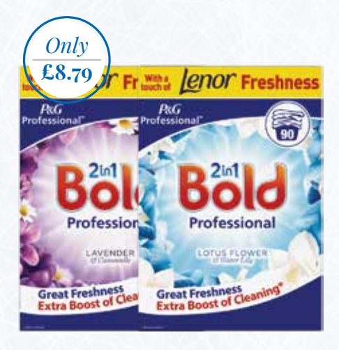
Bold Professional Powder 90 Scoop Lotus Flower | 550458 | 1 x 5.8kg Lavender & Camomile | 550454 | 1 x 5.8kg