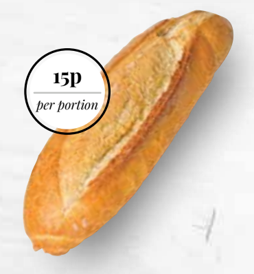
Musgrave Excellence Demi Baguette