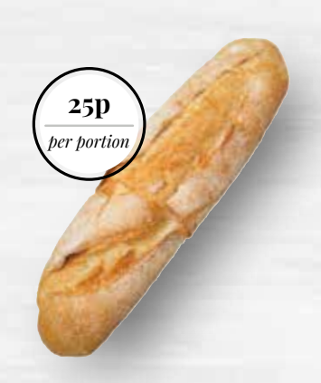
Demi Baguette 125g