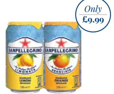
San Pellegrino Range 24 x 330ml £0.50 per unit incl. VAT