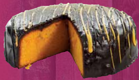
NEW Sticky Chocolate & Orange Cake 14ptn

A Victorian sponge cake with a twist; three layers of pink sponge with a soft yellow middle layer, all sandwiched together with buttercream and jam. It's then steeped in buttercream and surrounded by natural coloured hundreds and thousands.