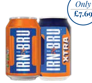
Barrs | 24 x 330ml Irn Bru | 548248 Irn Bru Extra | 554165 £0.38 per unit incl. VAT