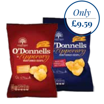
O'Donnell's Crisps | 24 x 50g Cheese & Onion | 692983 Salt & Vinegar | 692985 £0.48 per unit incl. VAT