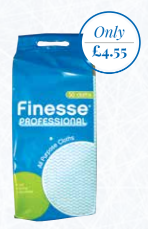
Finesse All Purpose Professional Cloths 635539 | 1 x 50 pce