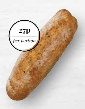
Brown Demi Baguette