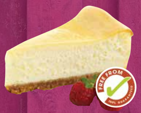
Gluten Free New York Style Cheesecake

A moist carrot cake made with pineapple carrots and coconut, with a combination of mixed spices, filled with cream cheese frosting and finished with nibbed hazelnuts