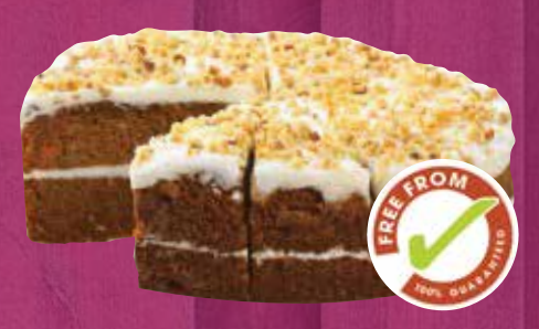
Gluten Free Carrot Cake

Dark chocolate biscuit pastry case filled with creamy thick coldset cheesecake flavoured with mascarpone cream and mixed with chocolate and cream biscuits. It's then topped with more biscuits, chocolate chunks and dark chocolate sauce.