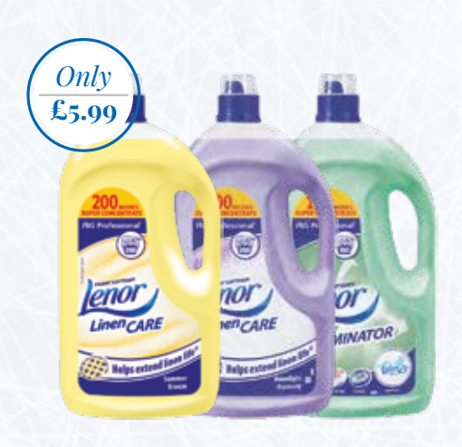
Lenor Concentrate Spring Awakening | 441232 | 1 x 3.8lt Odour Elimination | 444399 | 1 x 3.8lt Moonlight Harmony | 496404 | 1 x 4lt Summer Breeze | 496211 | 1 x 4lt