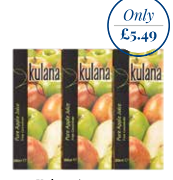
Kulana | 27 x 200 ml Apple | 663651 Orange | 663659 £0.24 per unit incl. VAT