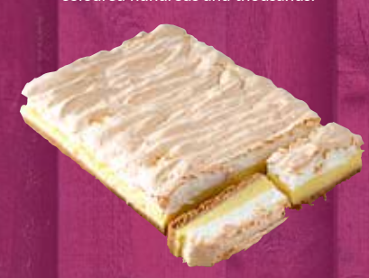
NEW Lemon Meringue Bar 18ptn

A real wow factor cake for all good coffee shops, pubs & restaurants. Layers of dark toffee cake, sandwiched together with a rich salted caramel buttercream, dripping in thick caramel sauce piled high with toffee cake cubes, all finished with a glossy salted caramel drizzle and a sprinkling of salted caramel crispy pearls.