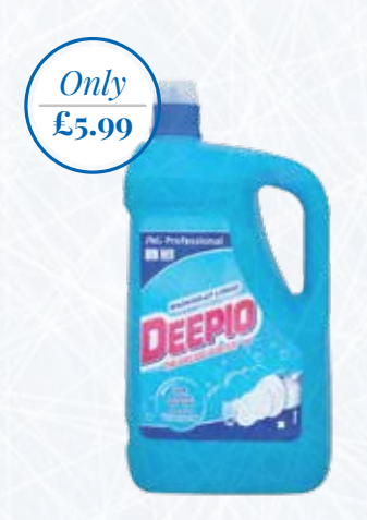
Deepio Washing Up Liquid 172615 | 1 x 5lt