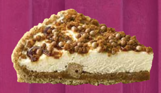
Cookie Dough Caramel Cheesecake 14ptn

A digestive biscuit base with a zesty lemon filling, topped with a generous helping of meringue and baked to perfection