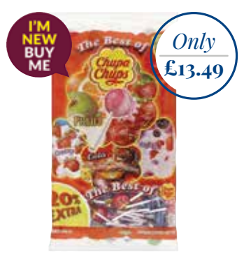
Chupa Chups Refill Bag 742557 | 120 x 12g