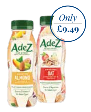
Adez | 8 x 250ml Coconut | 696856 Almond & Mango | 607607 Oat, Strawberry & Banana | 697608