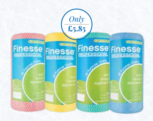
Finesse All Purpose Cloths Blue | 632301 | 1 x 100 pce Red | 632411 | 1 x 100 pce Green | 632471 | 1 x 100 pce Yellow | 632501 | 1 x 100 pce