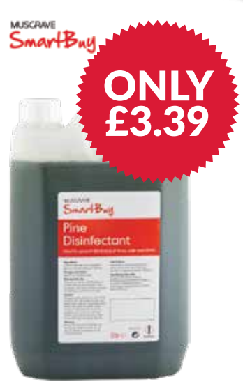
170032 Smartbuy Pine Disinfectant 1x5 ltr