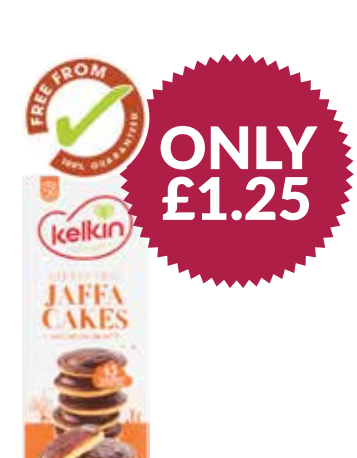
648821 Kelkin Gluten Free Jaffa Cakes 1x150 g