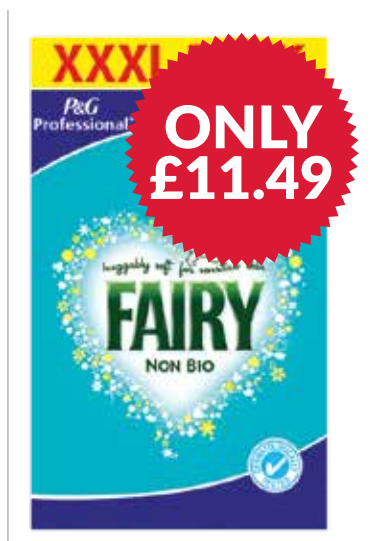
550471 Prof Fairy Non Bio Powder 90 Scoop 1x5.8 kg