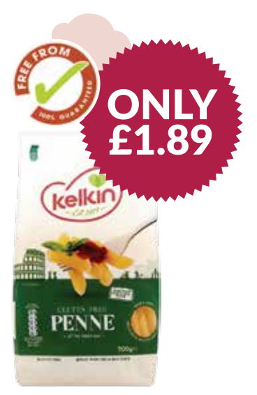
648851 Kelkin Gluten Free Penne Pasta 1x500 g