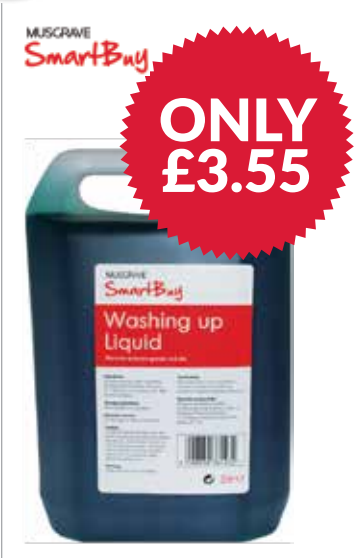
170038 Smartbuy Washing Up Liquid 1x5 ltr