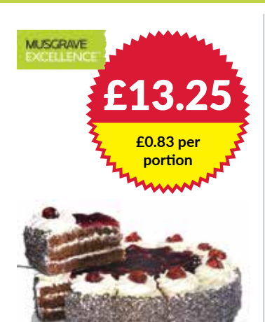
408056 Connells Blackforest Gateau 1x16 pce