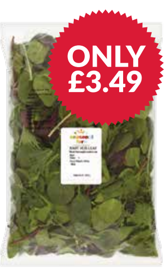
177377 Baby Mix Leaf 1x500 g