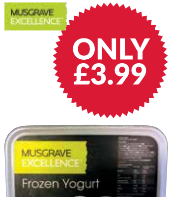
725347 Musgrave Excellence Frozen Probiotic Yogurt 1x4 ltr