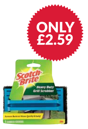
508985 Scotch Brite BBQ Handled Scourer 1x1 pce