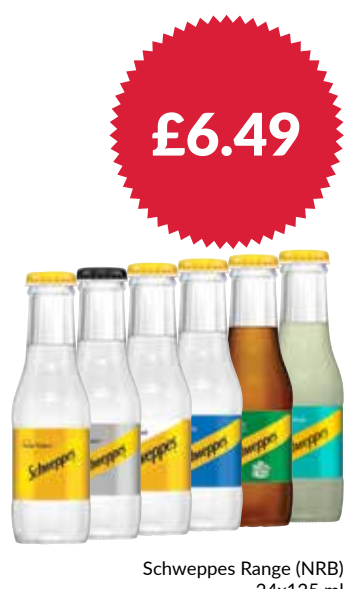
633730 Indian Tonic Water 633978 Ginger Ale ppes Range (NRB) 24x125 ml 633740 Elderflower Tonic Water 24x200 ml