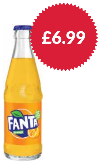
447596 Fanta Orange (NRB) 24x200 ml

Britvic 55 538531 Orange 538532 Apple 24x275 ml