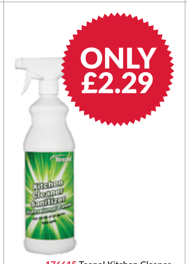
176615 Teepol Kitchen Cleaner Sanitizer 1x1 ltr