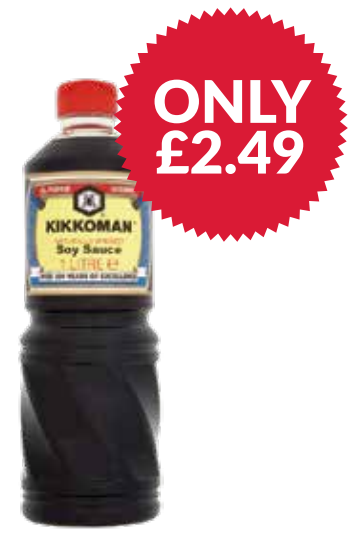
696348 Kikkoman Soy Sauce 1x1 ltr