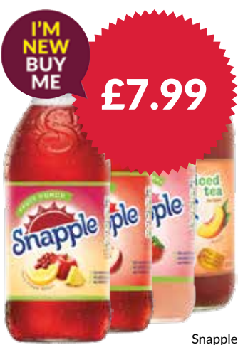
549515 Peach Tea 547855 Kiwi & Strawberry 549514 Apple 547853 Fruit Punch 12x473 ml