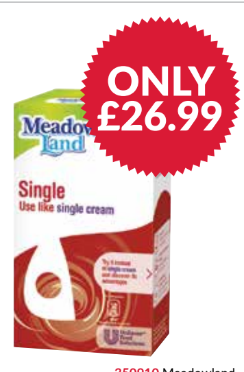
350910 Meadowland Non Dairy Cream 12x1 ltr