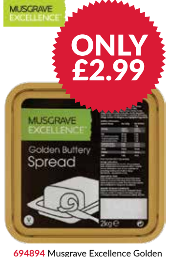
694894 Musgrave Excellence Golden Buttery Spread 1x2 kg