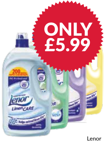
496211 Summer Breeze 496404 Moonlight Harmony 444399 Odour Elimination 441232 Spring Awakening 1x3.8-4 ltr