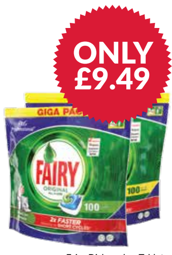
Fairy Dishwasher Tablets 544360 Lemon 545367 Original 1x100 pce