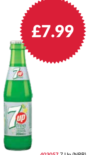
403057 7 Up (NRB) 24x200 ml