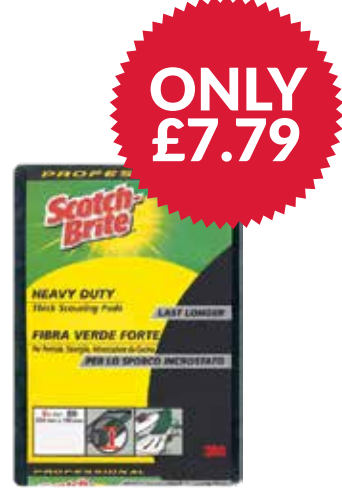
237011 Heavy Duty Scouring Pad 3M Pk 6 1801 1x6 PK