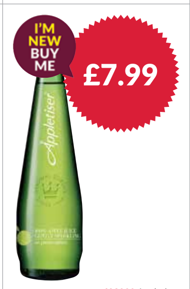
693000 Appletiser 12x275ml