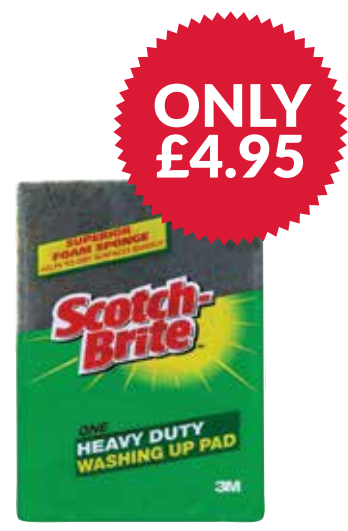
630959 3M Sponge Scouring Pads