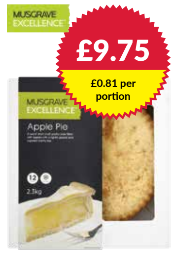
725710 Musgrave Excellence Apple Pie 12ptn 1x12 pce