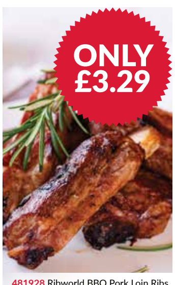
481928 Ribworld BBQ Pork Loin Ribs