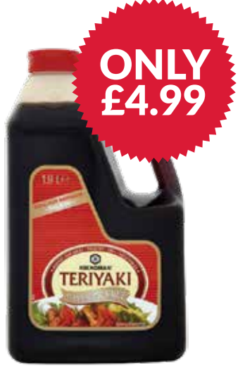
693903 Kikkoman Teriyaki Sauce 1x1.9 ltr