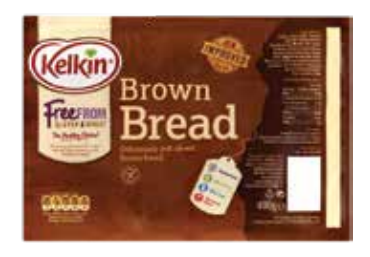
648959 Kelkin Gluten Free Brown Bread 1x400 g